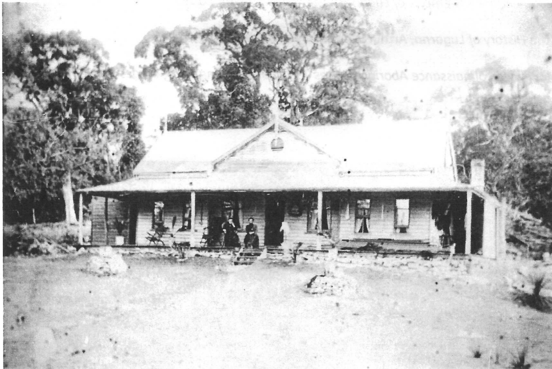
'Glenlee' 1908