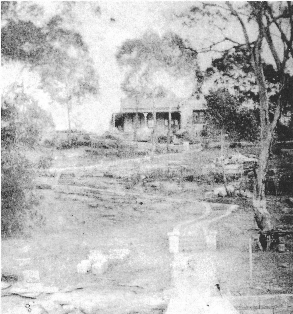
'Glenlee' 1914