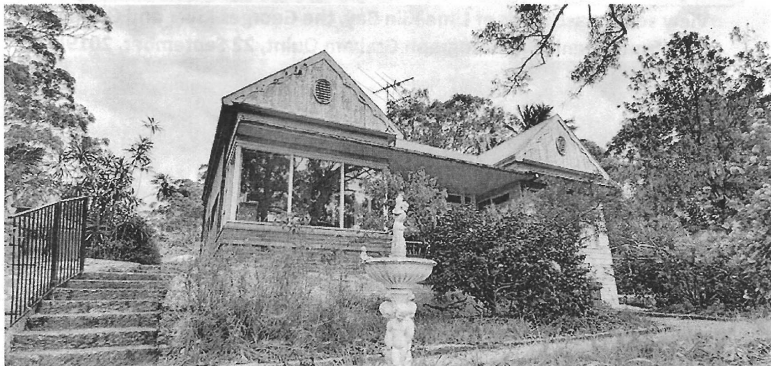
'Glenlee', Lugarno (photograph Graham Quint, 22 September, 2019)