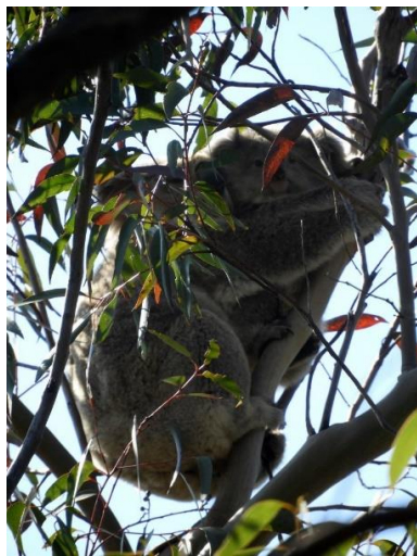
Mother and young in Heathcote NP